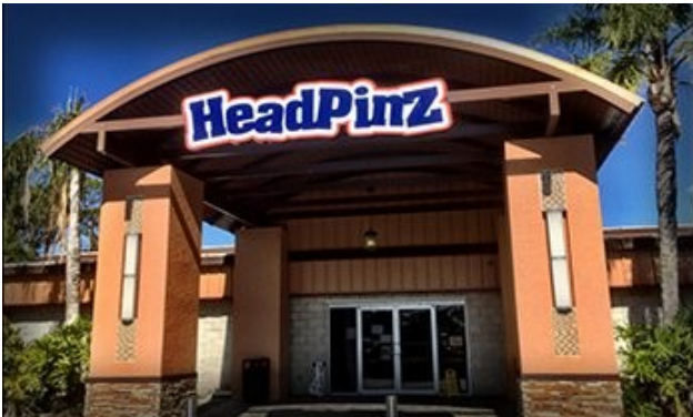
HeadPinz Entertainment Center 8525 Radio Ln, Naples, FL 34104