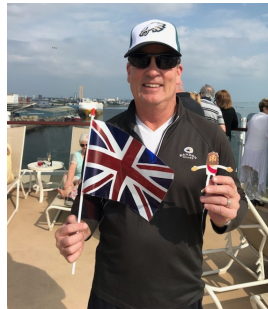
Send us your photo- graphs with your Jesus figures.