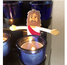
Lighting a candle for a loved one.