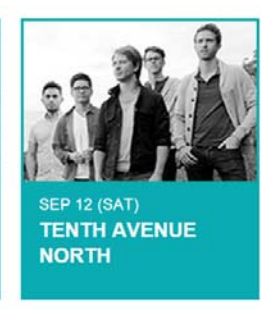
Check it out online. Google Rock the Universe 2018.