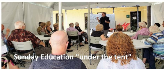
Sunday Education "under the tent"