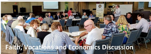
Faith, Vocations and Economics Discussion