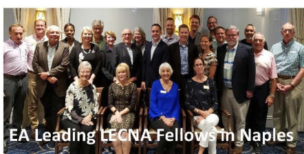
EA Leading LCNA Fellows in Naples