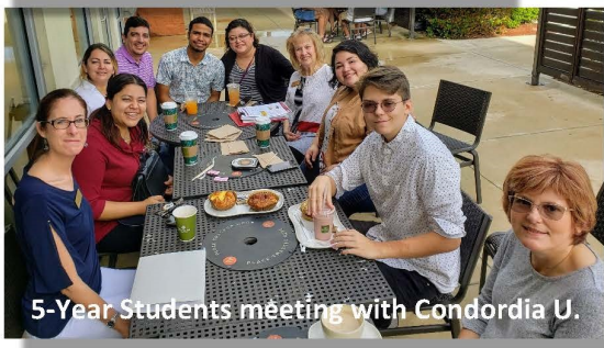
5-Year Students meeting with Condordia U.