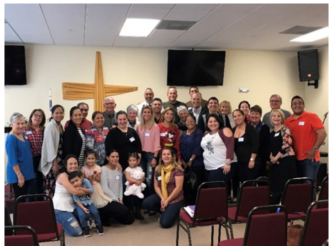
English Language Program- Tutors and Students

Starting in the June newsletter we will begin to share success stories from the tutors and students.